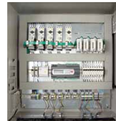
Remote Managment Control Systems

Energy Saving Applications Local and Optional Monitoring and Control