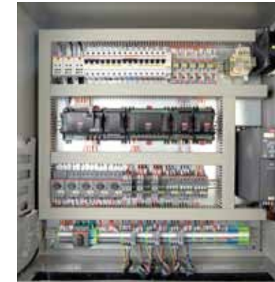
Remote Managment Control Systems